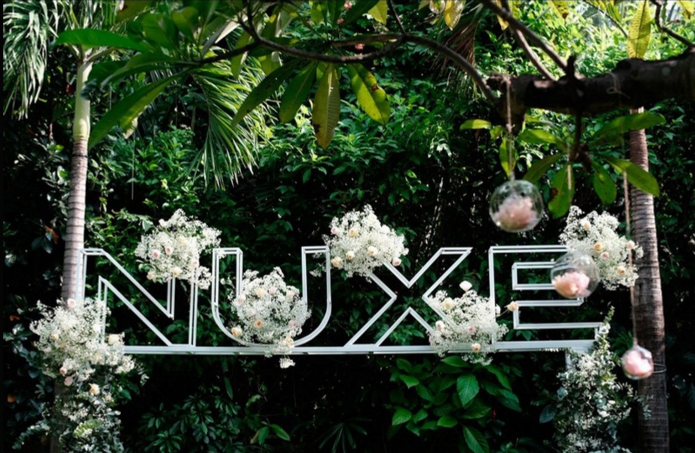
An inviting ambiance of a private gathering.