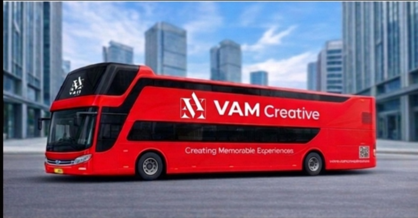
Double Decker Bus | Road Show